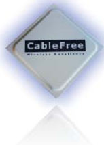
ICR Radio Unit