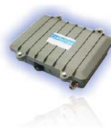
MPR Radio Unit