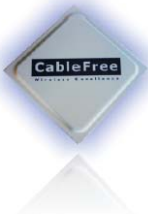
ICR Radio Unit