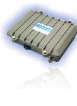
MPR Radio Unit