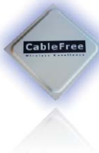
ICR Radio Unit