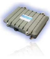
MPR Radio Unit